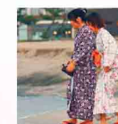
Relaxation Time in Modern Space