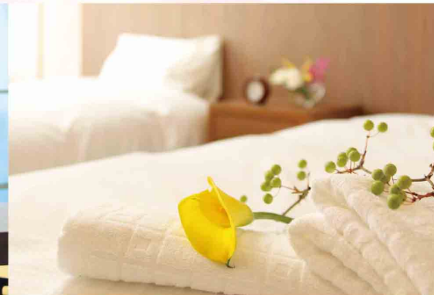
Tatami Room with Park Side View Double