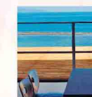
This is an ocean view semi suite where you can forget everyday life