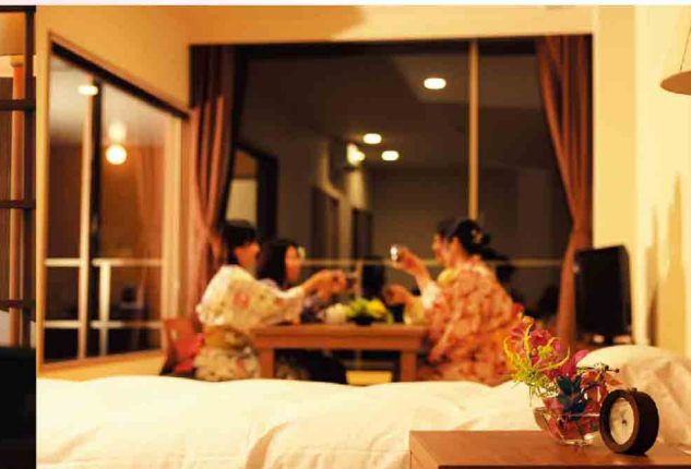
Deluxe & Ocean View Spa